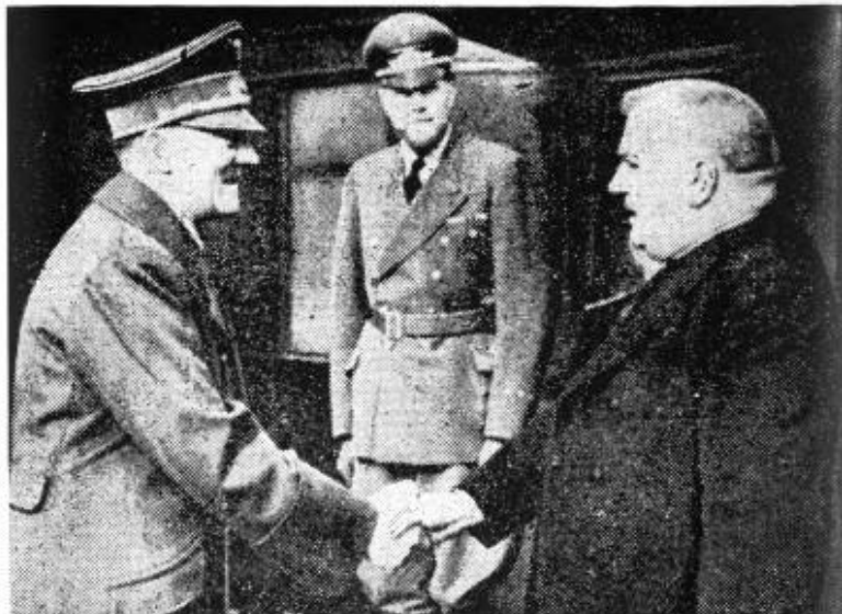
Reichsfuehrer Hitler greets the Rt. Rev. Msgr. Joseph Tiso, Slovakian Chief of State, Papal Chamberlain and Roman Catholic priest, at Hitler's field headquarters on the Eastern Front, October, 1941.

After the first World War the government of the promising young democracy realized the danger threatening it from the Vatican and it tried to evade it. But the effort was not sufficiently bold and courageous. A sort of compromise was made with the Vatican, in order to attain a modus vivendi . That was the mistake. The Czech leaders should have known that a modus vivendi with the Vatican meant death. Well-instructed in Europe's history, they should have remembered the old French proverb: Qui mange du pape, en meurt — that is, literally, "He who eats from the pope dies."