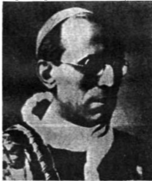
EUGENIO PACELLI—HOW POPE PIUS XII

The idea of a Chief of Christendom, himself also a Chief of State, presiding over an assembly of Chiefs of State, is a medieval conception which has no place in our twentieth-century democratic world. It has been revived for political reasons, and unless denounced, will prove a dangerous challenge to freedom and progress. For just as the equality of individuals, the equality of nations is a fundamental principle of democracy.