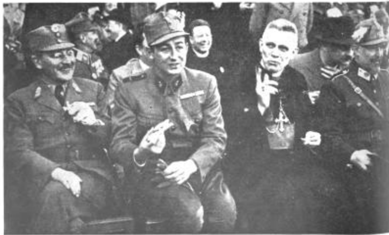
Left to right: DR. SCHUSCHNIGG, PRINCE STAREMBERG AND CARDINAL INNITZER SMILE THEIR APPROVAL OF DOLLFUSS.

Austria now became an ecclesiastical state with a papal encyclical as constitution and the Archbishop of Vienna, Dr. Innitzer (made a Cardinal after the butchery) as its virtual head. It did not take the new government long to show its true colors. From the first moment of victory, dissension split the two government parties and public administration began to show signs of deterioration. Corruption and nepotism spread so rapidly that before long they became the only keys to all higher posts in public service. At the same time heedless squandering of public funds developed for the benefit of party leaders on one