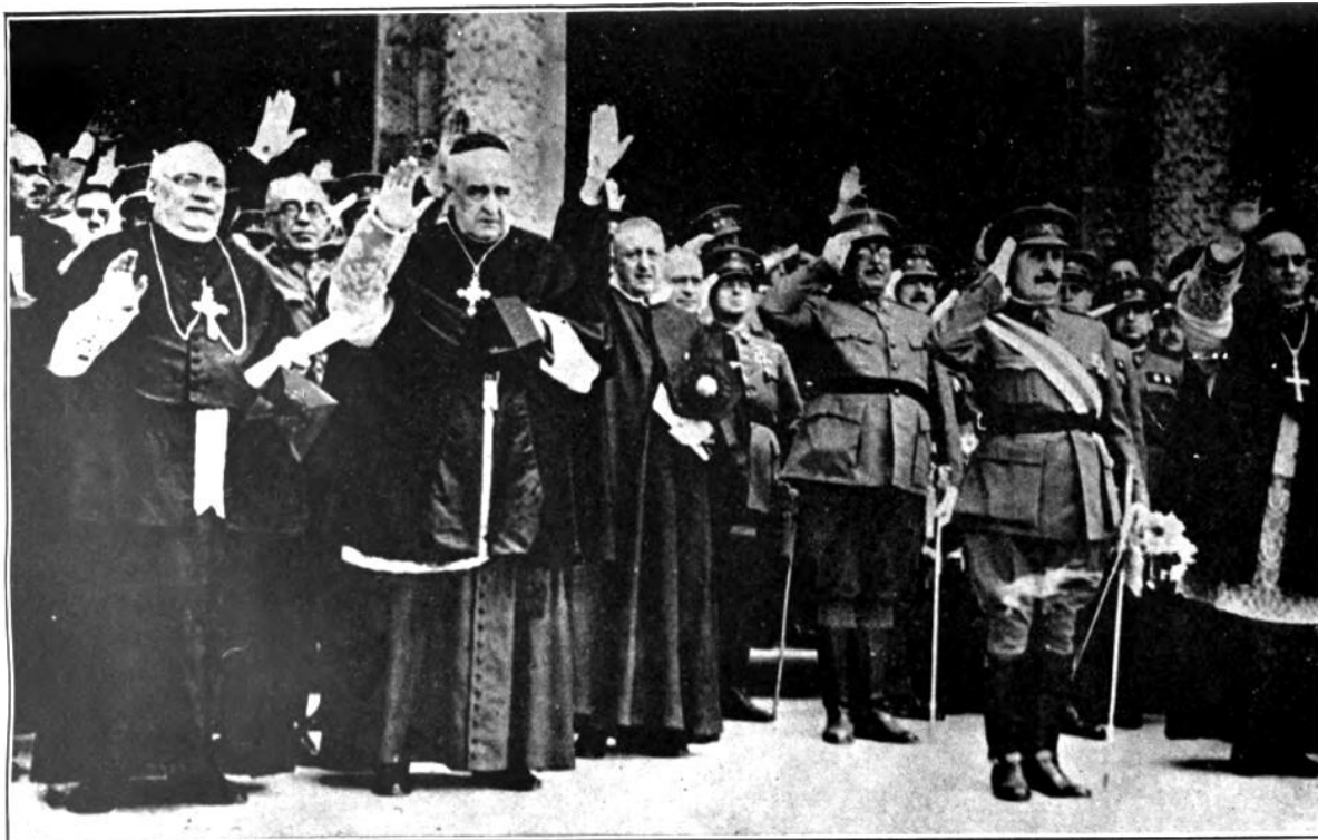
The Spanish Catholic Hierarchy giving the Fascist salute at Santiago de Compostela in 1937; left to right, the Bishop of Lugo, the Archbishop of Santiago, the Canon of Santiago, General Aranda, General Dávila, the Bishop of Madrid.