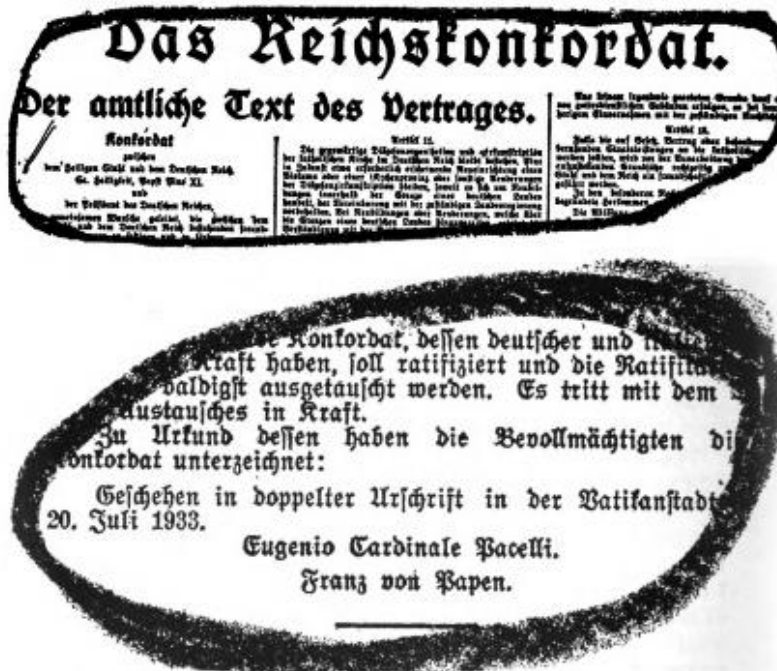
The text ends as above: "Signed in duplicate in Vatican City on July 20, 1933. EUGENIO CARDINALE PACELLI FRANZ von PAPEN."

Article 16 of the above concordat between Hitler and the Vatican gives the wording of the oath that all German bishops are obliged to take before the Reichstatthalter , as follows: