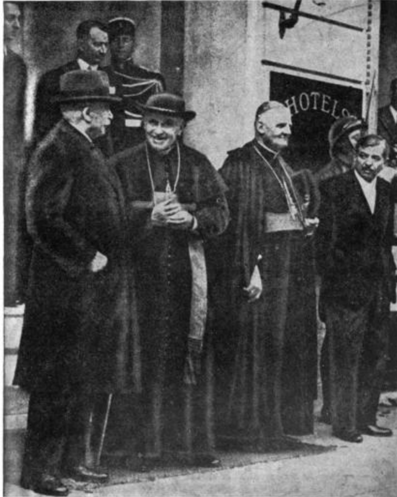
This photograph from Vichy shows two Roman Catholic Cardinals with Chief of State Marshal Pétain and Chief of Government Pierre Laval reviewing a parade of Vichy-French troops.