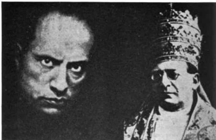
IL DUCE MUSSOLINI