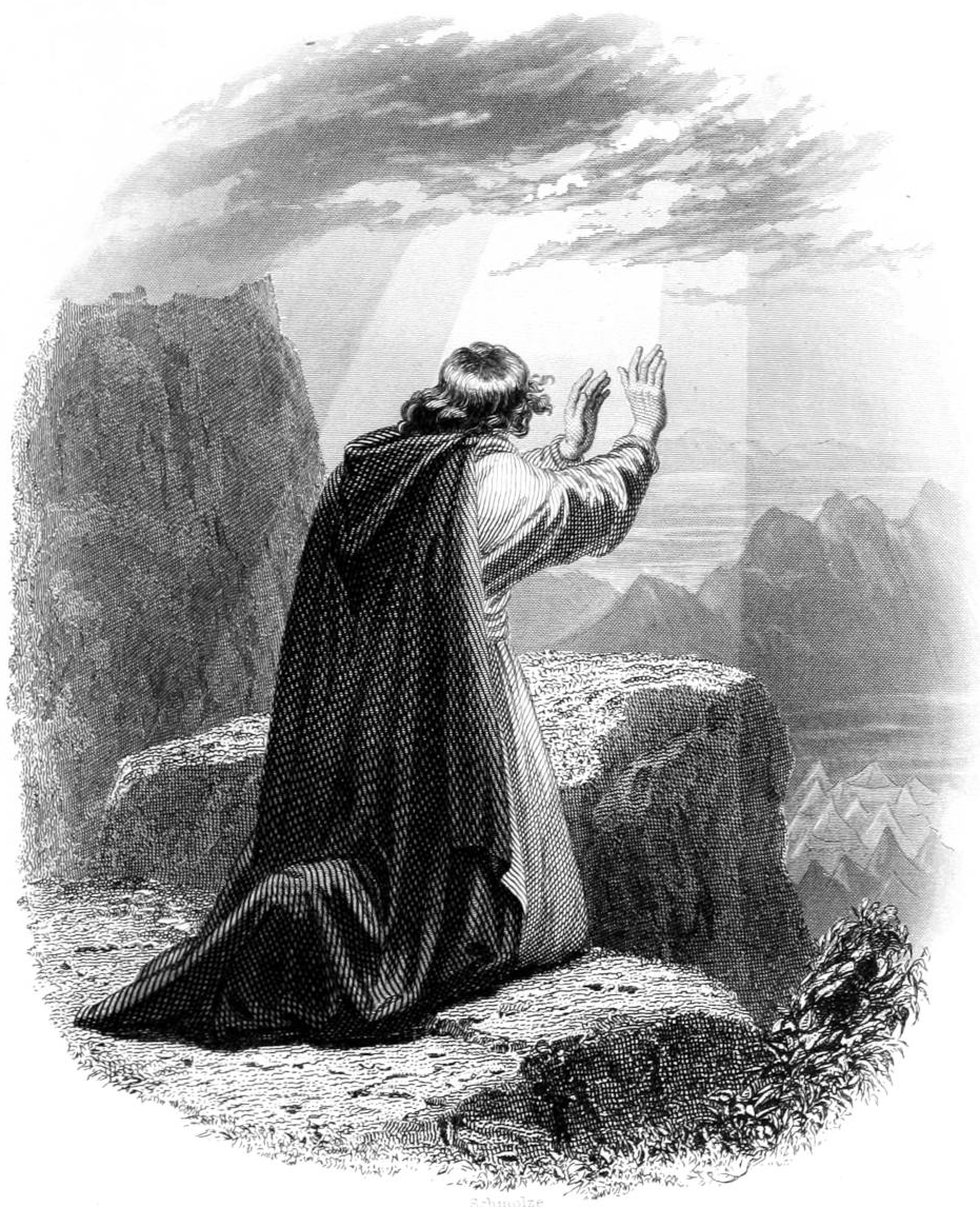
MOSES ON THE MOUNT.