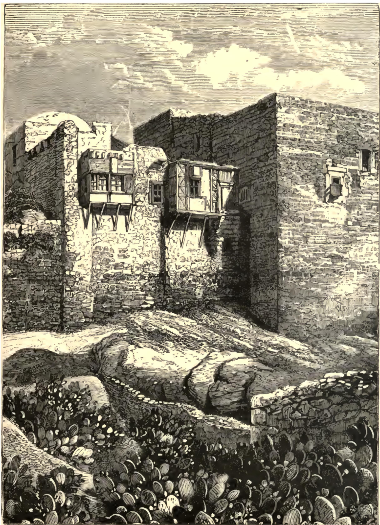
WALL OF JERUSALEM.