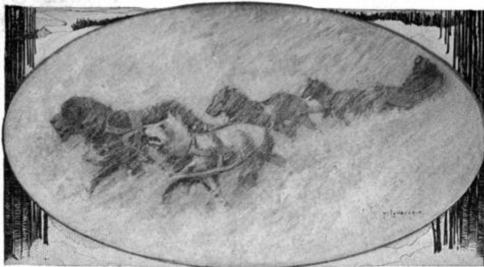
A RIDE IN A WILD, HOWLING BLIZZARD.

tion. And grandly did he perform the tremendous task, as with one of his cheery barks he sprang forward in the tempest, Koona, with slackened traces, gladly dropped back, and was quite content to resign the leadership to the more powerful dog. During the long run that followed, never once did the bewildered dog seem to wish, as many a dog does, to again take his position as leader. Koona seemed to have had enough dog sense to know that Jack, in this trying ordeal, could do better work than he, and so he ran beside the larger dog and at times cleverly availed himself of the protection thus afforded to shield himself from some of the fiercest blasts of the storm.