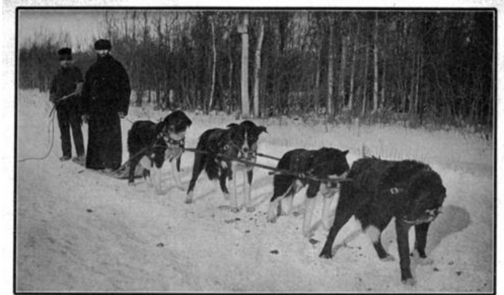
STILL ON THE TRAIL WITH THE DOGS.

loose cap with large fur ears. A long fur coat was very comfortable, but as such garments are very expensive, we found out that very comfortable and serviceable attire could be made for us by the native women, out of the warm Hudson's Bay blankets of the country. To these coats as well as to similar garments, were attached large warm hoods. These hoods, which are called capotes in that country, are very comfortable not only by day when traveling but when pulled up over the fur cap at night.