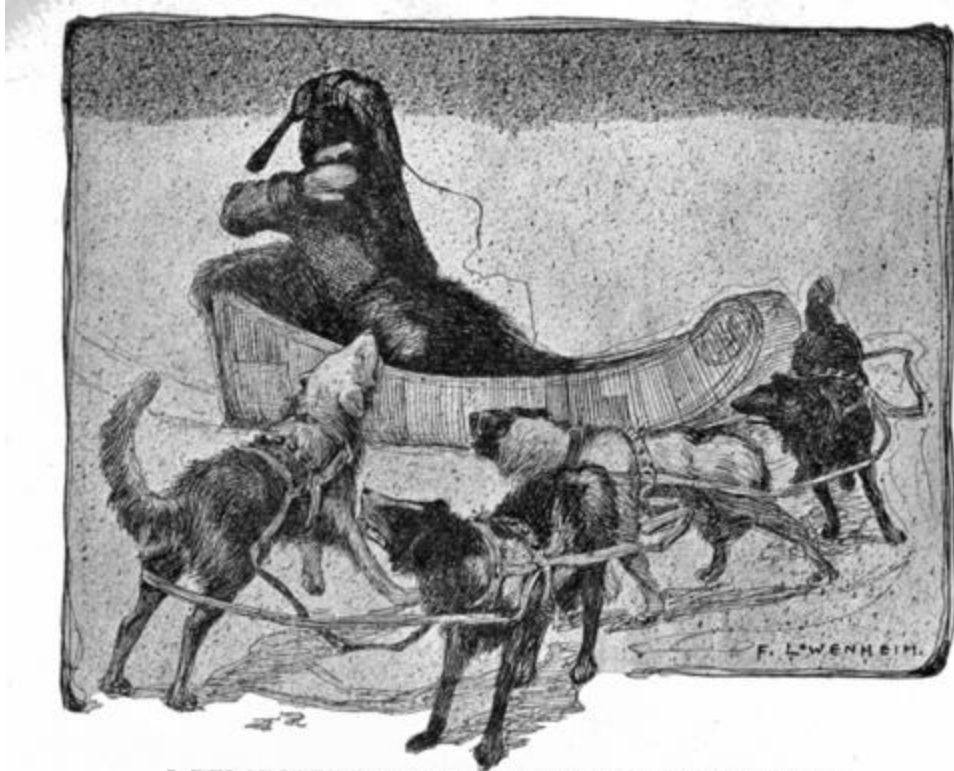
I BELABOURED HIM WITH THE OAK WHIP-HANDLE.

He proved the ugliest customer of all, and I never before imagined a dog's head could take such a pommeling ere he would give in. Failing to get hold of me, he tore the robes and parchment side of the cariole. It was well for me that the traces of the fourth dog, fastened to the front of the cariole, so held him back, that he was unable to do more than savagely growl at me, while he at times fastened his teeth into everything within reach. His efforts however kept the cariole twisting in a most erratic fashion, and so I had to keep up the fight and at the same time look well to my balance so as not to be upset.