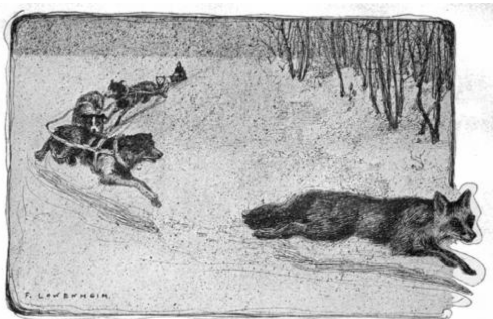
THEY DASHED IN WILD EXCITEMENT AFTER THE FOX.

rhythmic measure, they danced along, just above the horizon and then with a sudden bound, they flew up into the heavens above us, only pausing in the midway course for a second, to flash out in some more glorious color or to be changed into forms of more ravishing beauty. When the zenith was reached the grandest transformation of all took place. For here came whole multitudes from those who seemingly had been engaged in the carnival of blood, to the white-robed innocent and unstained spirits of light, In myriads they came, and as though every one knew its place they rapidly formed in the very zenith above us the crowning glory of the auroral displays, the perfect corona, the grandest vision the eye of man ever gazed upon. How it scintillated and blazed above us, a crown of splendor, a fit diadem for Him, "on whose head are many crowns!" Then, as the whole corona blazed out in equal brightness, the shadow of my dogs was thrown completely under them. These ghostly shadows seemed to startle and stimulate their pace, as, to the sole music of their little bells, they rapidly sped along. They seemed also to startle something else, for out from a rocky island on our left, there dashed a splendid black fox. He was indeed a beauty, and so vivid was the Aurora that I had a very fine view of him, as he rapidly hurried across our trail and struck out for a well-wooded, rocky island, perhaps half a mile on our right.