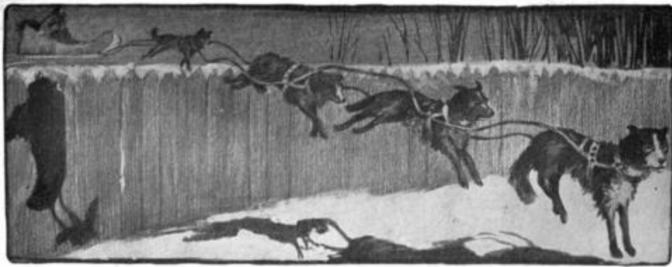
IT WAS A WILD, MAD LEAP.

But ere the journey ended, they played me a shabby trick, and in a measure got their revenge on me. At the bottom of the hill, on which the house of this native agent was built, he had dug a trench and there fixed a heavy stockade to break the force of the wild storms that, sweeping over the lake, drifted the snow around his home. This stockade was fifteen or eighteen feet high. The storms had so piled up the snow on the lake side that it was now level with the top; while over the other side there was a drift of only about five or six feet in depth.