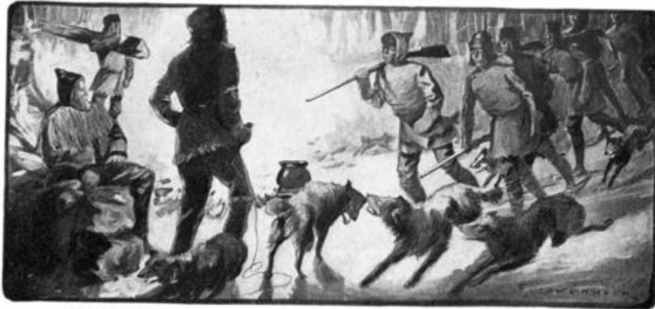
A HALF DOZEN WILD LOOKING INDIANS RUSHED INTO OUR MIDST.

While two of the men with whips and clubs kept the invading Eskimo beasts out of the camp, with my other Indian I chatted with these visiting strangers. They told me that they had come from the Cumberland district to fish through the ice on Lake Winnipeg, and hunt what game they could find in the forests on the shore. They said that they had had very little success and were very hungry.