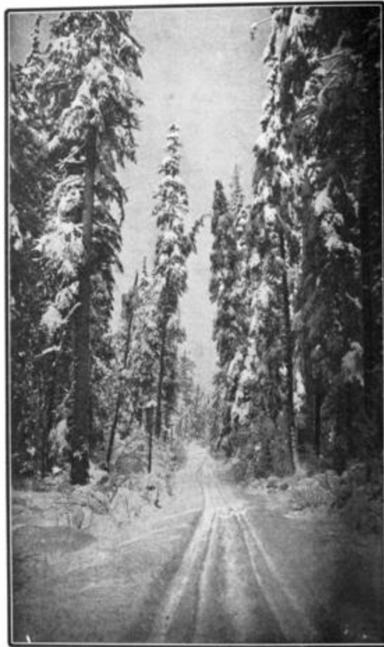
THE LORDLY PINES IN WINTER DRESS.

There are absolutely no roads, or paths, or trails, for hundreds, nor even thousands, of miles. The result is that there is absolutely no other way of winter traveling than with dogs, except going on foot, and even that becomes impossible when distances are greater than those where men can carry their own supplies. For their supplies mean much more than merely the food a man would consume. It means his bedding, weapons of defense, axe, snowshoes and various other things, in addition to kettles in which to cook his food. Hence to those who would there travel, the dog is simply invaluable, in spite of his many defects.