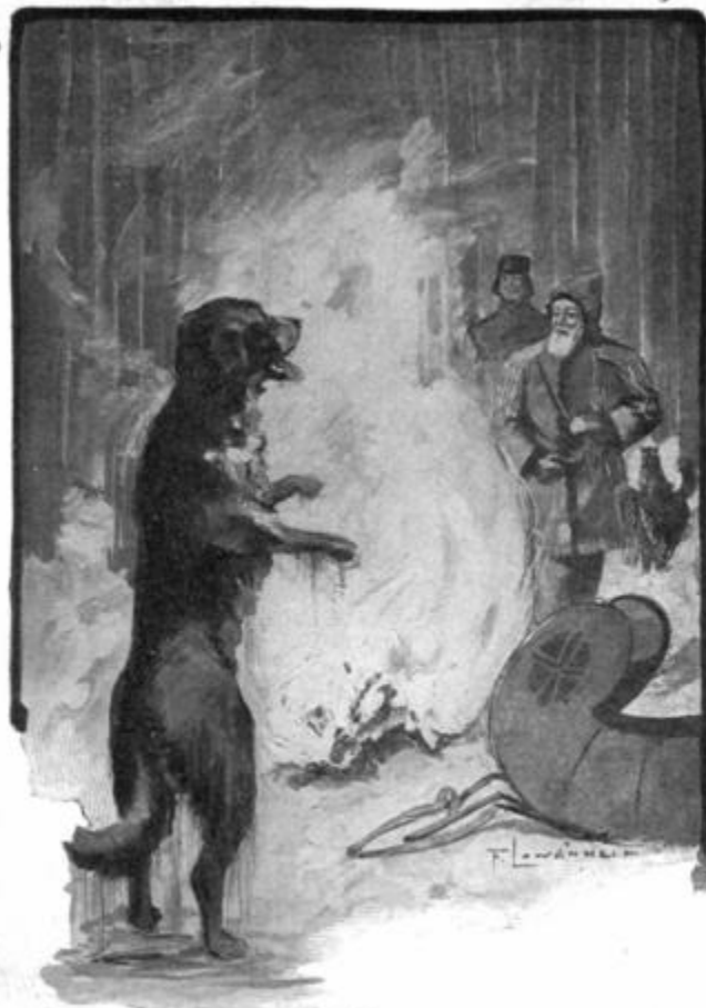
JUMPING AROUND THE FIRE LIKE A DANCING BEAR.

so thoroughly dry himself, was one of the principal camp fire stories among the Indians for many a year.